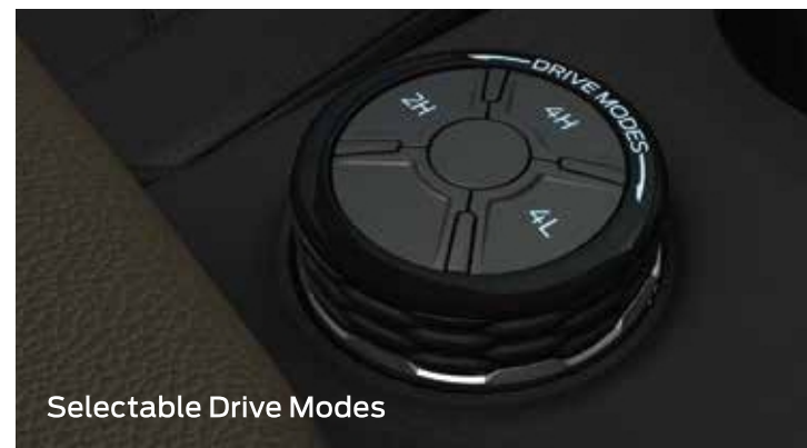
Selectable Drive Modes

With 800mm water wading capability, the Next-Gen Everest comes prepared for the rainy season.